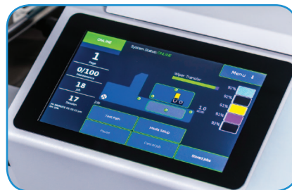
Intuitive 7" color touchscreen displays system status, image preview, and provides access to stored jobs