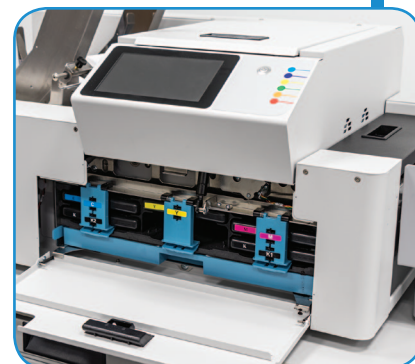
Clamsell design offers easy front access to ink tanks and paper path