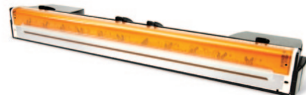
Memjet® print head has 70,400 ink nozzles for higher speeds, lower ink use and less noise than standard print heads